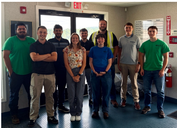
Current Cadet Engineers with previous Cadets that are now full-time HG&E employees.

We look forward to seeing what the future holds for this young engineer. The Cornelius J. Moriarty, Jr. Scholarship for Cadet Engineers is open to City of Holyoke residents who are graduating from a duly accredited senior secondary school and have been accepted into an accredited engineering program. The Cadet Program has allowed HG&E to keep engineering talent local. Currently, 18 full-time employees came through the program at the start of their careers. For additional application criteria, please contact HG&E at (413) 536-9300 or visit www.hged.com/cadet .